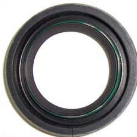
316 SS Garter Spring

Tides Marine's replacement nitrile lip seals are specifically designed for each sealing system (propeller shafts / rudder stocks) produced by Tides Marine.